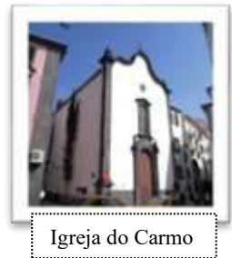
Igreja do Carmo